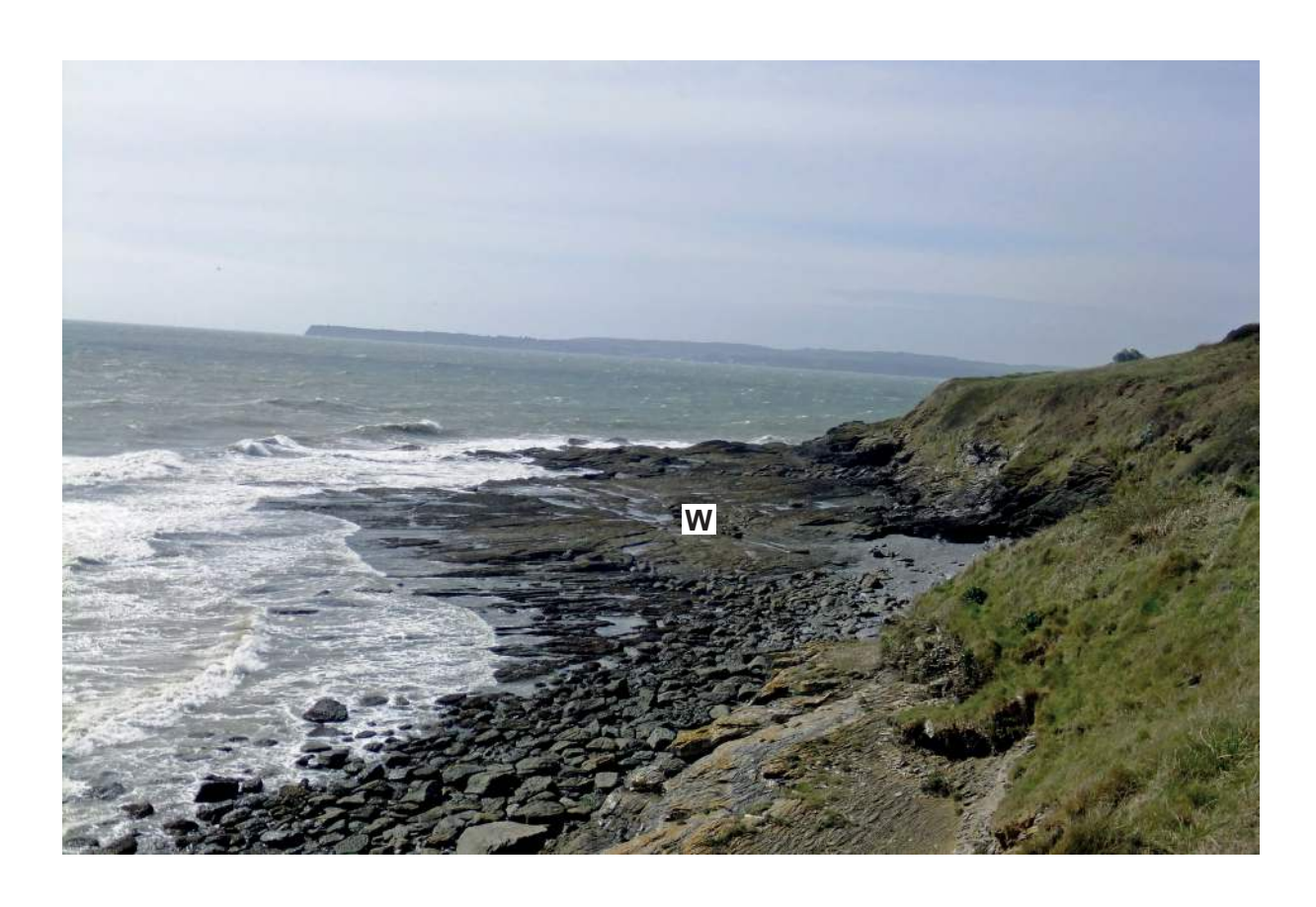
Figs. 3.1 and 3.2 for Question 3